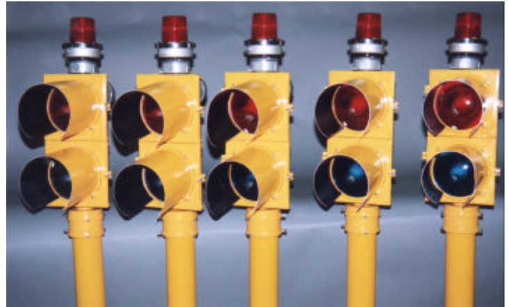
Group of 2-head units supplied to NJ Garden State Parkway

The poles are 4-inch diameter steel with a 10" square base plate painted to match the heads. Violation alarms include a choice of either Red or Yellow flashing beacon with either an alarm buzzer or bell. The bell is continuous ring style. The buzzer is integrated with the flashing beacon, the bell is mounted separately behind the unit. A terminal block inside the lower signal head allows for easy connections including a wiring diagram in each unit.