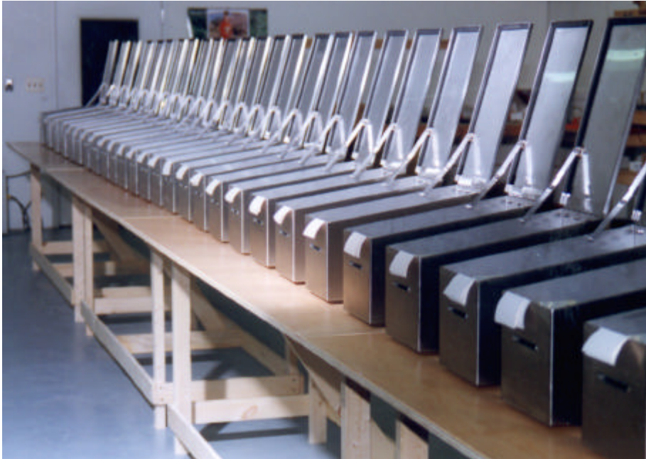
Stainless Steel Receipt Printers

Tolltex fabricates receipt printers using components available in the US. The printer uses the latest in thermal print technology, which produces very high quality receipts at a very fast rate. The printers are enclosed in a stainless steel cabinet with a hinged top that lifts open to load the 6-inch diameter roll of paper. Receipts are issued through a slot located in the front of the enclosure and an automatic cutter is used to cut the receipt to the proper length.